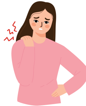
Fatigue and Muscle pain