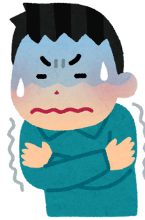
Chills and Shivering