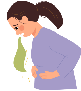
Nausea and Vomiting