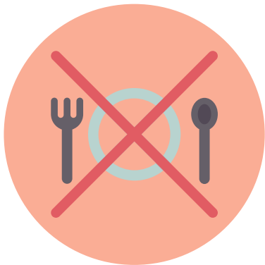
Loss of appetite