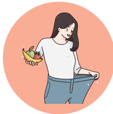
Unintentional weight loss