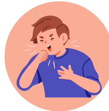
Coughing that lasts 3 or more weeks