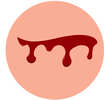
Coughing up blood