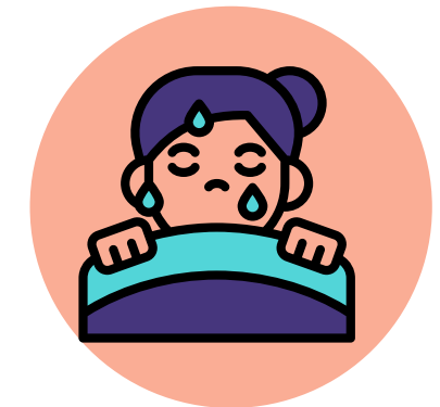
Night sweats & Chills